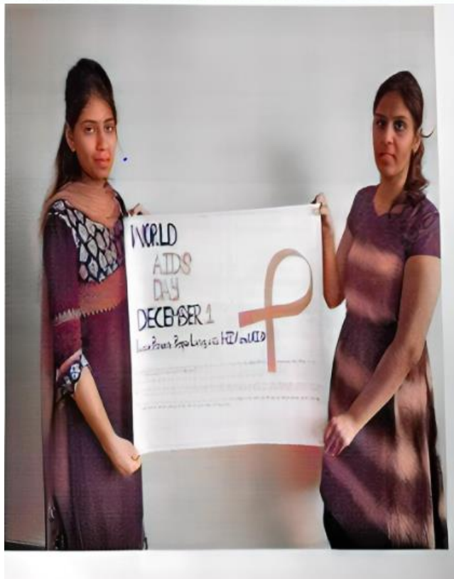
(Students showing AIDS Awareness Poster)